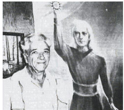
George Adamski, standing by a painting of one of his "contacts" from Venus

Together we left the lobby, I walking between them. About a block north of the hotel, they turned into a parking lot where they had a car waiting. They had not spoken during this short time, yet inwardly I knew that these men were true friends. I felt no urge to ask where they proposed to take me, nor did it seem odd that they had volunteered no information. An attendant brought the car around, and the younger man slid into the driver's seat, motioning me to get in beside him. Our other companion also sat with the front seat. The car was a four-door black Pontiac sedan. The man who had taken the wheel seemed to know exactly where he was going and drove skillfully. I am not familiar with all the new highways leading out of Los Angeles, so I had no idea in which direction we were