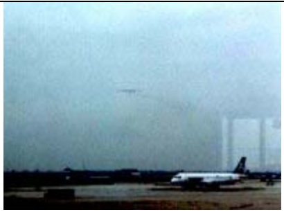
Alleged O'Hare UFO Photo

in which the Neo-conservatives lost control of both houses (U.S. Senate & House of Representatives) in the U.S. Congress. Prior to this date, it appeared as though the US under the administration was head toward an internal police state, as key legislation such as the Military Commissions Act has been passed and signed under which U.S. citizens could be designated as enemy combatants for the first time since the U.S. Civil War.