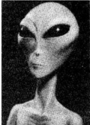
Short Gray ET

Whites on their antigravity craft. Hall says, “When the USAF Generals got off the craft they were laughing like they had just come back from the world’s best amusement park.” 31