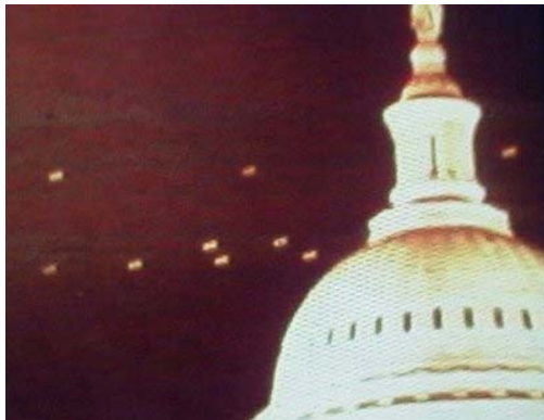
July 1952 Washington UFO Flyover

Direct, face-to-face contact with aliens near Roswell led to a defensive mobilization and at least some sub-rosa skirmishes with aliens. As a result, the US military worked to reverse-engineer alien technology in order to be able to match it. Leading scientists were allowed to analyze the Roswell artifacts if they swore to secrecy. Their early analyses were impressive. They suggested that the Roswell craft used a kind of Tesla technology featuring something like the Biefeld-Brown effect, which had been discovered decades earlier. 9 Early findings were only preliminary, but continued research led to the use and misuse of strange, new technologies. Given that the Roswell craft had crashed while buzzing the sole US nuclear bomber base, human use of alien technology for weapons purposes may have provided a convenient excuse for more aggressive intervention, here, by the Roswell Grays' larger alignment of aliens.