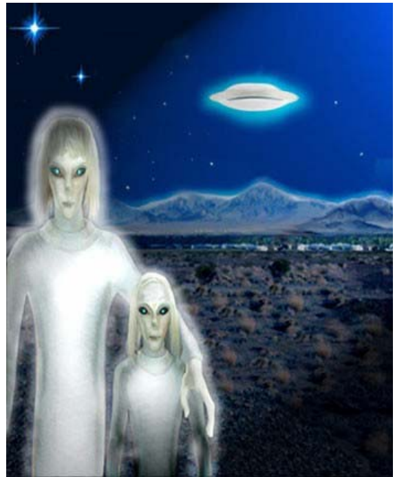
Tall White adult and child depicted