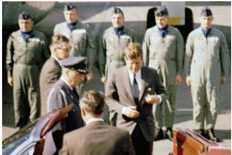
Pres Kennedy arrives at Homestead Air Force Base – 11/25/1962

Whatever the truth of claims that Kennedy had been unofficially briefed about the Roswell UFO crash while a congressman in 1947; personally saw extraterrestrial vehicles and bodies early in his administration; received extraterrestrial messages; or even met with human looking extraterrestrials, there is little doubt that he attempted to gain official