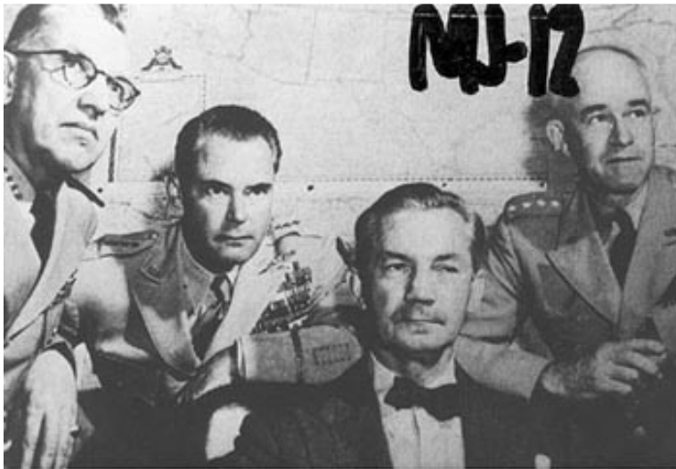
Secretary Forrestal (2 nd from right) with other alleged MJ-12 members