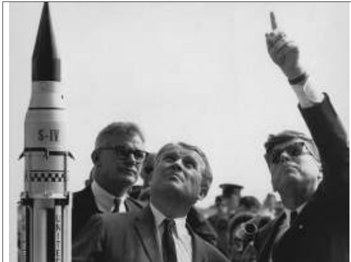
Sky-watching: Von Braun and JFK aim higher

When we take a look at evolutionary history in relation to the development of the human species we see a fundamental shift from basic evolutionary processes to what Timothy Leary 1 called 'epigenetic' culture. At this point we became increasingly aware of ourselves outside of the cold, mechanical biological development that preceded it and this manifested in what we could suggest was the start of human history - insofar as societal culture as we now see it developed with our ability to record written or visual information. As part of this vast shift in perception, civil structures and the associated power vectors that accompany such things also became more complex and dominant. In a similar way that we can see religious hierarchies often served the purpose of keeping 'sacred' knowledge for an elite few in the priesthood, a contemporary parallel is the post World War 2 cover-up of the fact the planet is being engaged by a range of non-human intelligences.