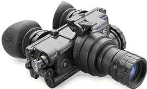
Generation 3 night vision image intensifiers.

resolution and easy operation - bringing objects way out in near earth orbit and closer into view in the night sky. Gen 4 tech supposedly improved on its predecessor as it allowed a faster shift from the low input 'field' environment to the more active and partially lit urban environment, losing some of the clarity we require for spotting some of the seemingly astonishing things that are going on above our heads right now. Sufficient quality Gen 3 night vision goggles or scopes [see illustration] can be sourced for between $1500 and £3500.