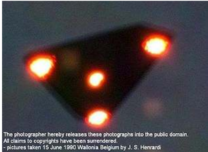
Black triangle as seen over various Euro countries over 80s/90s

It may appear premature to draw conclusions such as that above and yet when we impose the night vision grid on top of the construct we've highlighted so far we may not be far off. Some of the longer term users of N.V. technology in this area have proven the existence of not only fleets of triangular craft in at various heights in orbit but also claim to have seen 'battles'