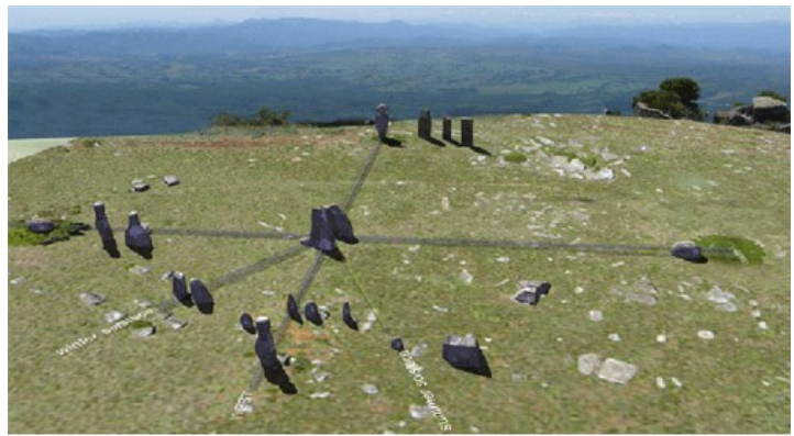
Adam’s Calendar, South Africa