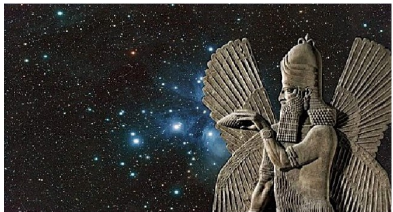
The “god” Enki Holding Hornels Stone. Used to levitate stones, with Orion Constellation

We did not evolve totally in isolation as the Darwinians would have had us believe. Common sense tells us the galaxy is teeming with an array of intelligent, technologically advanced beings. Furthermore, humanity, during our relatively short existence of 250,000 or so years, has been profoundly affected by various extraterrestrial visitors to the point that almost everything we are and know was given us by the “gods” of our ancestors; advanced extraterrestrial visitors. This paper will show that modern humanity was largely a result of genetic manipulation, and our civilisation a