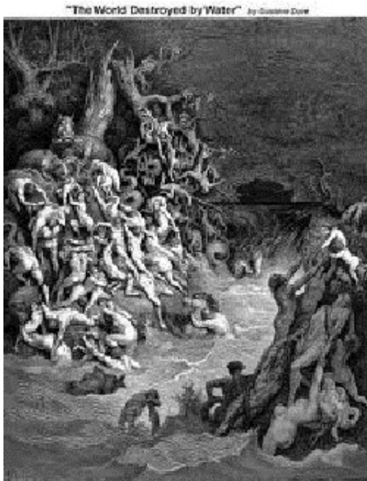
The Great Flood of Noah's Time

The god of the Old Testament demanded that the people obey him and his laws. He required their servitude and humble obedience. And he could be very cruel if disobeyed. In Exodus 15:3; "The Lord is a man of war; Yahweh is his name." 29