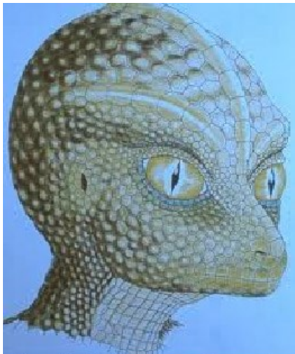
Earth Reptilian, Lacerta science. 11

The worker being was likely created to be physically smaller, but strong enough to toil for long hours; intelligent enough to obey and undertake simple tasks. At first without reproductive organs these simple human workers were cloned in great numbers in the Abzu in circular vats, which still exist in their many thousands. 6 And now because of the work done creating clones of Dolly the Sheep we know that cloning is possible. 7 Additionally, we also know genetic manipulation is possible, as the autopsies conducted on extraterrestrial clone type beings recovered from crashed UFOs by the US Government in the 1940s and 50s show us this. 8 Many of these beings have no sexual organs, or only the very remnants of ones and therefore are likely cloned. Furthermore, eye witness descriptions of Grey alien type clones have reported that they are often seen naked and have no sexual organs, navel, and a minimal or absent digestive tract. 9